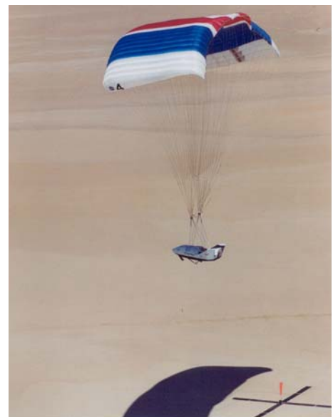
The X38 Crew Return parafoil system from Pioneer Aerospace