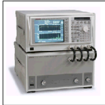
The Advantest Q7750 Optical Network Analyzer measures chromatic dispersion of fiber optic network components.